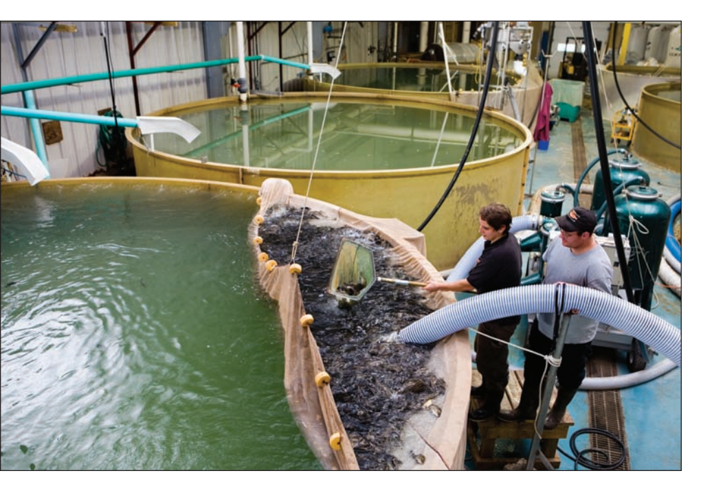
THE MULTIPLICATION FACTS Aquaculture technicians at the Australis facility in Turners Falls vacuum juvenile fish from a nursery tank to electronically sort and count them.

also had shown a kind of natural gift for venture capitalism, helping to arrange a $500,000 grant from the Pew Charitable Trusts that was used to build a marine-ecology facility at Hampshire.